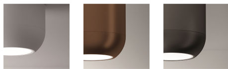
BC Wrinkled white