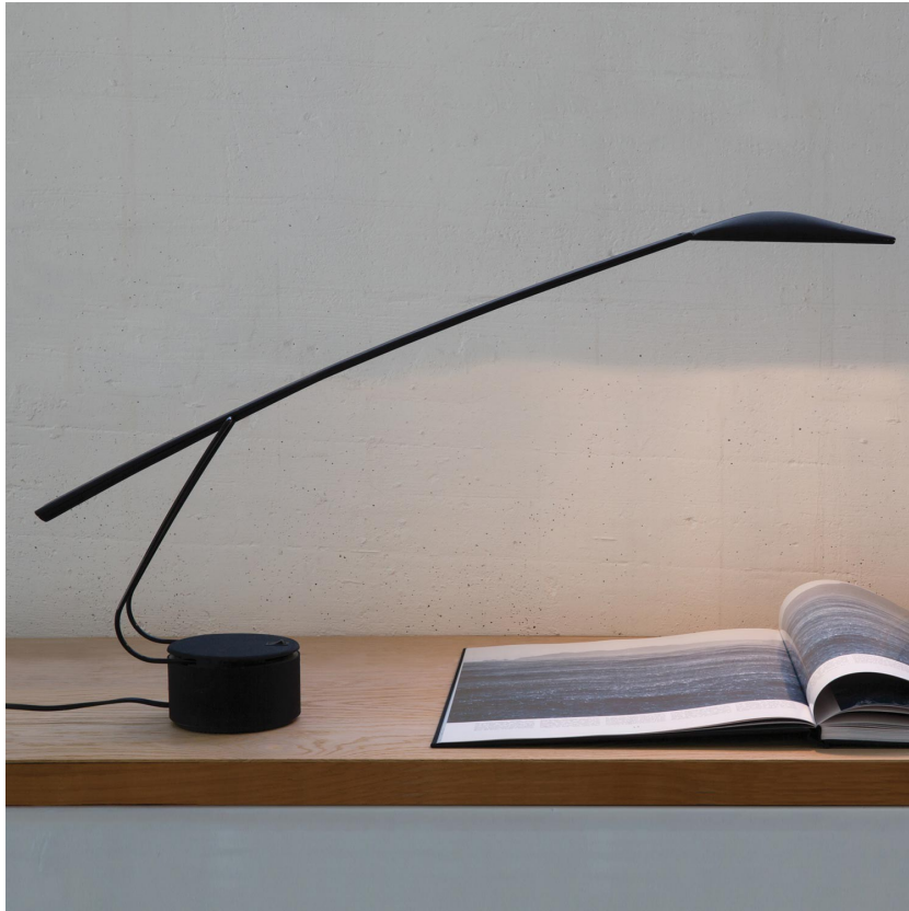
Table light with medium-flood beam, ideal as a task or as a reading light. Body in polycarbonate, arm supports in molibdenum steel. Painted in matt black. Double intensity switch.