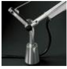
TOLOMEO SUPP.TAVOLO FISSO A004200