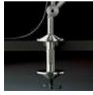
TOLOMEO MORSETTO A004100