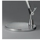
TOLOMEO BASE TV ALL D230 A004030